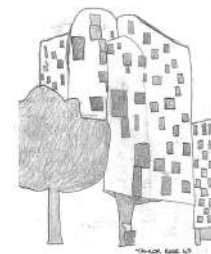
Sketches of the library exterior

Have a look around your home and think about what materials you have to create your building.